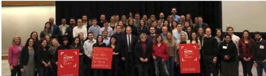
NXT-GEN Fellowship for Moral Leadership

The NXT-GEN Fellowship for Moral Leadership helps leaders build moral authority in their respective realms and then use it to do meaningful things. Participants from business, civil society and government develop their own moral codes, senses of purpose and personal leadership frameworks and skills.